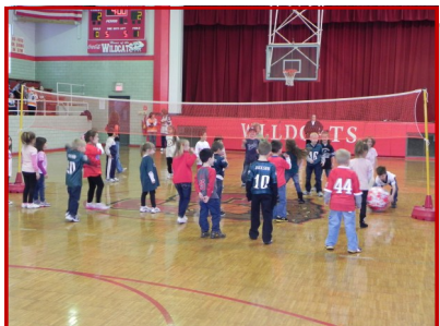
Left: Kindergarten gets in on the action during their volleyball game. Kindergarten is the first year that students play in the tournament. They were very excited to be able to