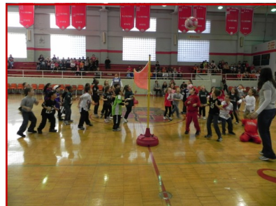
Above left: 8B battles for volleyball bragging rights with the teachers. On the right, 2A and 2B show off their skills in their match-up.